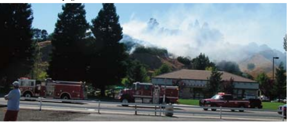
Had this Moraga bottle rocket fire of six years ago occurred in 2015, the environmental damage could have been much higher.

The driver lost control of the car as the tional negative consequence of illegal mortar shells exploded. The young man sitting shotgun took the full brunt of the blast in his face and on his torso.